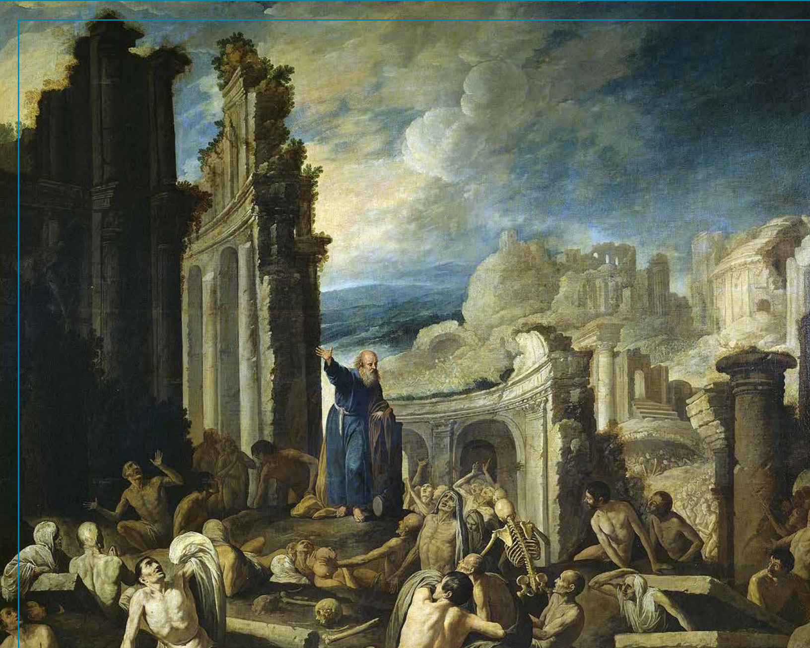
"The Vision of Ezekiel" (1630) by Francisco Collantes

Being in exile and receiving such a vision must have excited Ezekiel and those with whom he shared the vision. To be so far removed from a place you grew up – a place you love, a place from which you were banished, and then – hope! Hope that God would return to that place, that temple where you experienced the glory of God! If God goes back, surely you would get to go back too, right?