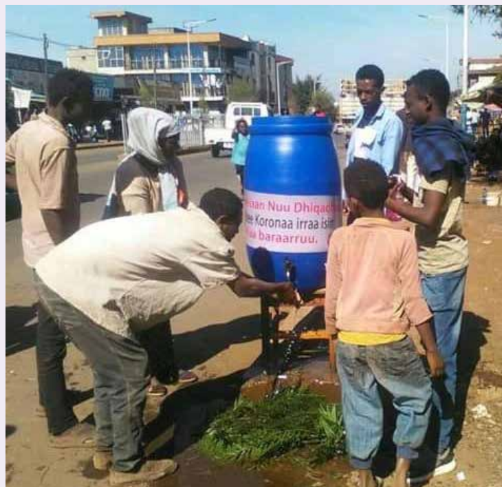
Student leaders in Nekemte, Ethiopia, provide a hand-washing station as well as sharing crucial information on counteracting COVID-19.